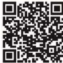
Hā’ena State Park