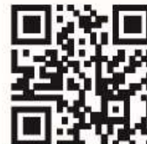
North Shore Shuttle