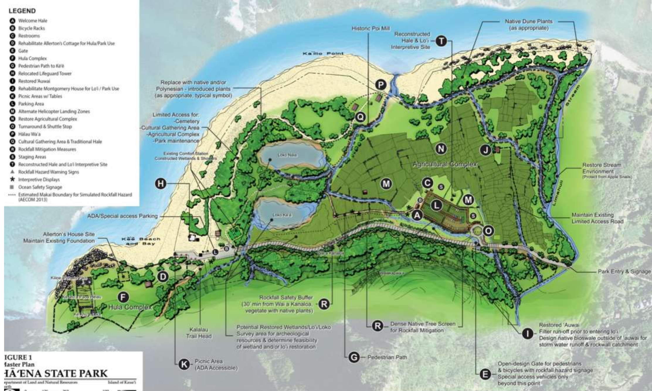
FIGURE 1 Master Plan IĀ'ENA STATE PARK